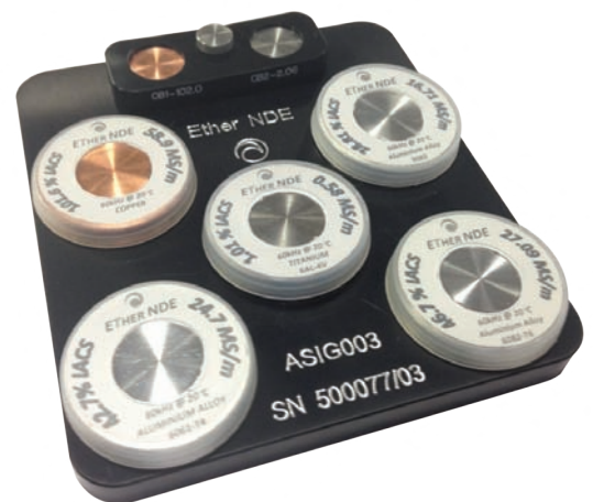
Conductivity Test Blocks In Holder

ETher NDE also manufacture individual conductivity test blocks which may be used to match the clients own testing requirements. We can also provide a handy test block holder (Part number: ASIG003) that can hold up to five of these test blocks at any one time as shown above.